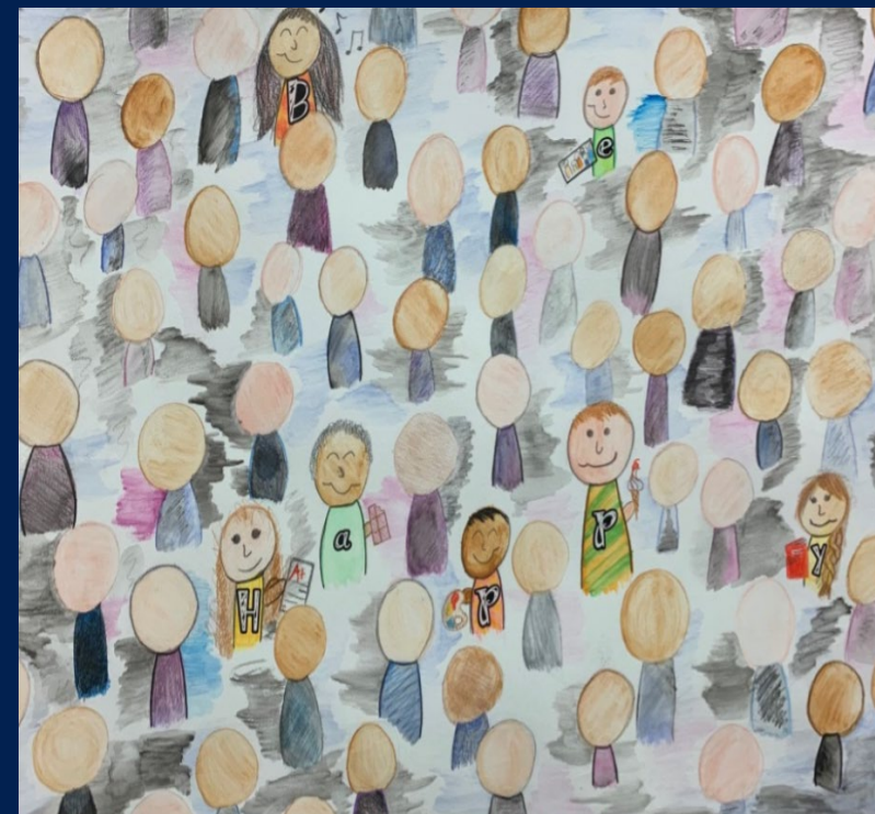
"IN A SEA OF SADNESS" Ava R. , 2nd place for Elementary Original Artwork 2021 Children and Adolescent Art Contest